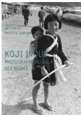
KOJI INOUE A PHOTOGRAPHER BEYOND SIGNS (PAL & NTSC)